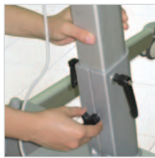
Adjustable mast height – 3 positions