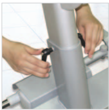
Quick release mast