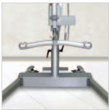
Extra low 39cm lifting height to allow floor lifts