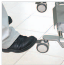
Rear castors with brakes for security